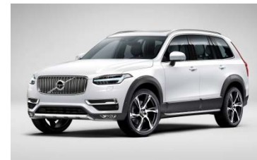
2015 Volvo XC90